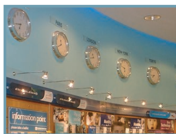
The Carephone Warehouse / United Designers