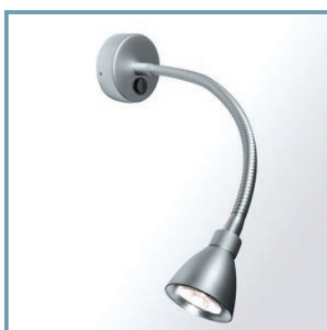
AL-05/SW/M1/Y/300mm - satin chrome