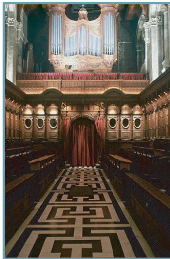
Hertford College Chapel / DPA Lighting