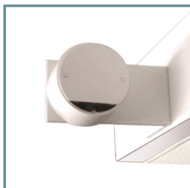
WakeUp - microwave presence detector