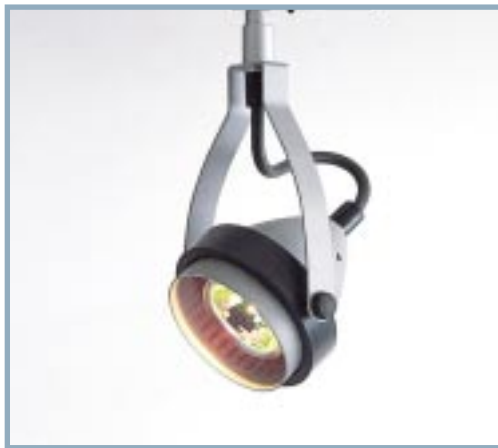
SL-50 / Tracktrans

The SL-100 with built-in reflector uses an inexpensive capsule halogen lamp. Track or ceiling mounted with a integral transformer option.