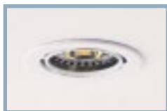
SL-50 / R / Fixed